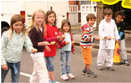
A steady hand