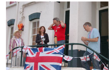
Medals all round