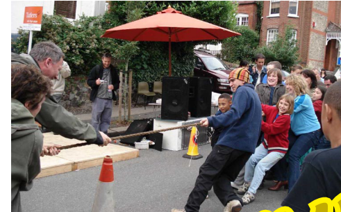
Last tug but one