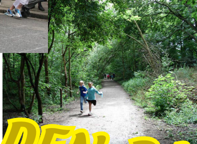
Out into the country