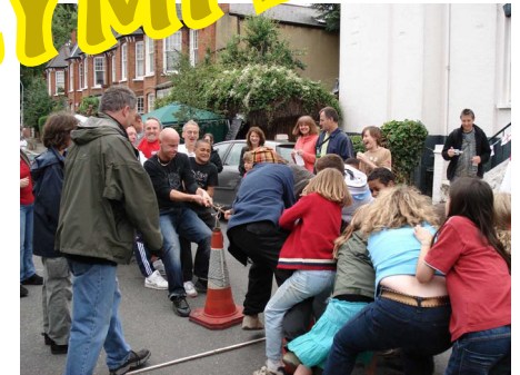
That final tug