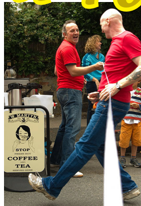
Surprise finish Mind that coffee stall!