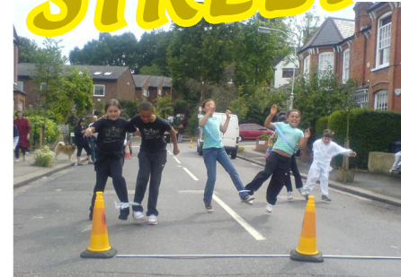
Three legs good