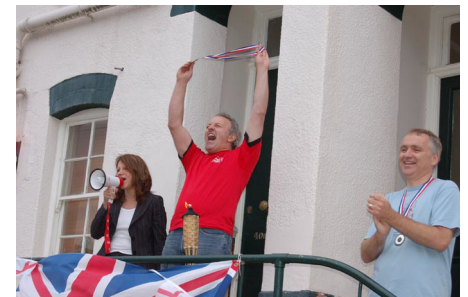
Flatliners come out on top