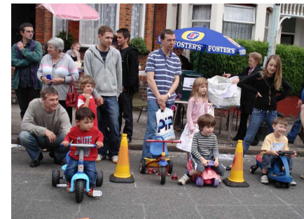
Roll that dice