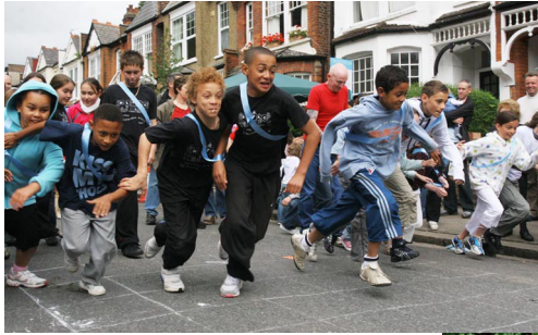
Start of the Marathon Look out for the bald guy in red