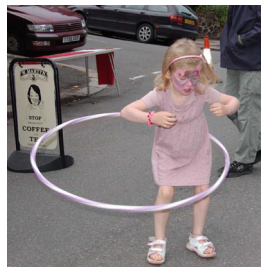
Never too young