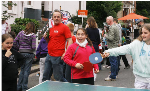
Who's for Tennis