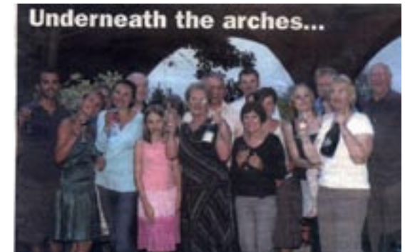
The Hillfield Park Arch-angels

Fight local developments that spoil the environment, eg by blocking out views and natural light.