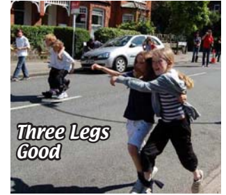
Three Legs Good