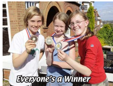
Everyone's a Winner