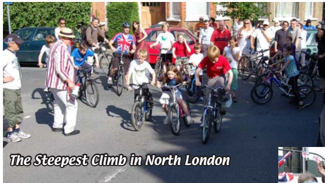
The Steepest Climb in North London