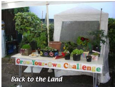
Back to the Land