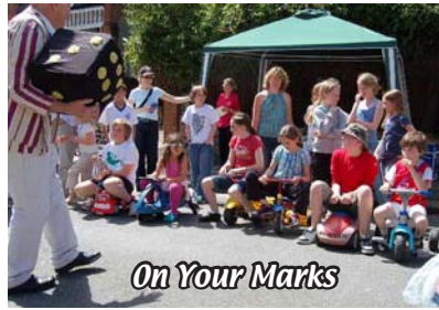
On Your Marks