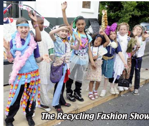
The Recycling Fashion Show