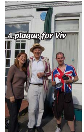
A plaque for Viv