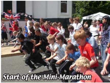
Start of the Mini-Marathon