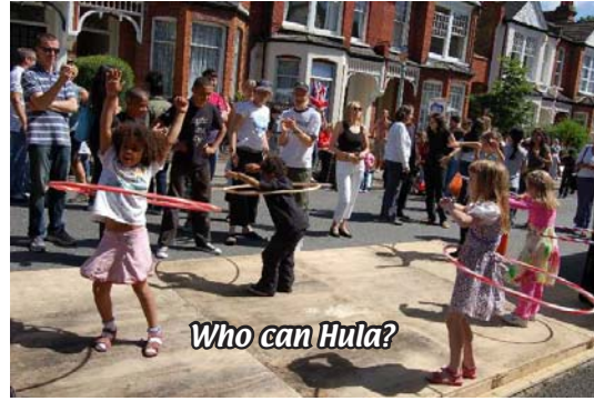
Who can Hula?