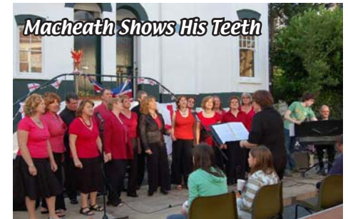
Macheath Shows His Teeth