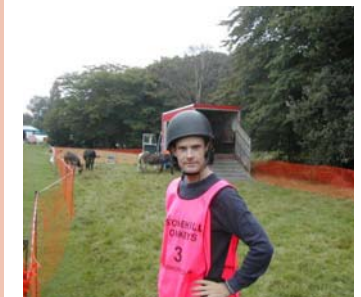
Donkey? What donkey?

That leaves us with £220.37 in hand and we decided at our most recent general meeting to make a donkey sponsorship donation of £120 to the Hornsey Trust who run the