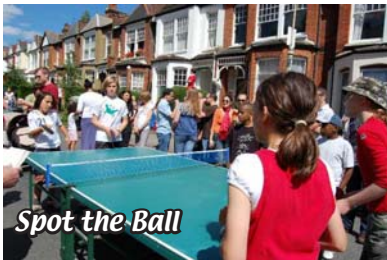
Spot the Ball