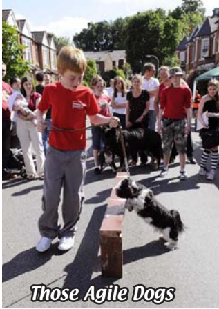
Those Agile Dogs

"Hillfield Park residents light the Olympic torch" - Ham & High