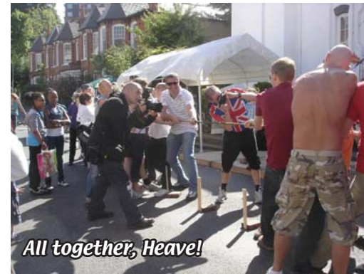
All together, Heave!